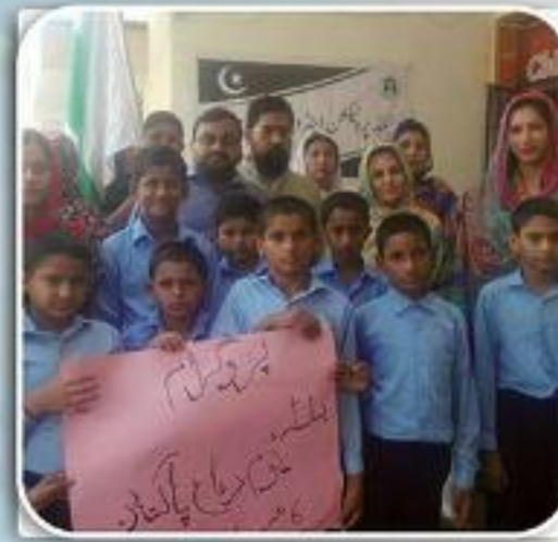
Defence Day Celebration at CPI Multan