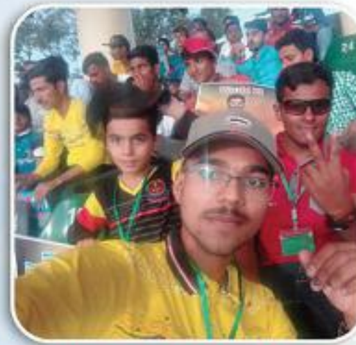
Children at Qaddafi Stadium Watching Cricket Match