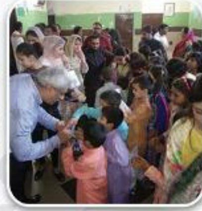
Provincial Health Minister Khawaja Salman Rafiq celebrated Eid ul Azha with children of CPWB Lahore