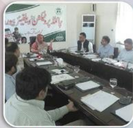
Orientation Meeting of Director General with Officers