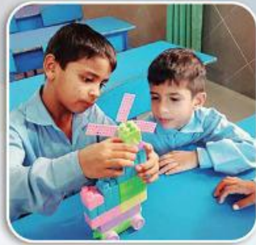
Playing and Learning Activity for Children of CPI Gujranwala