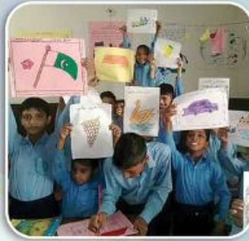
Painting and Drawing Competition at CPI Faisalabad