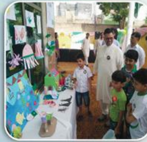
Exhibition of Handicrafts Prepared by Residing Children at CPI, Rawalpindi