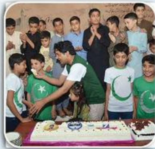
CPWB Rawalpindi Children at 7 th Anniversary of National Youth Assembly