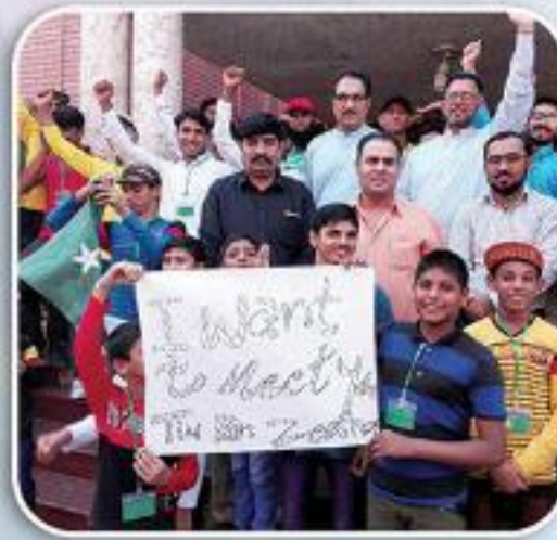
CPWB Children leaving to watch Cricket Match