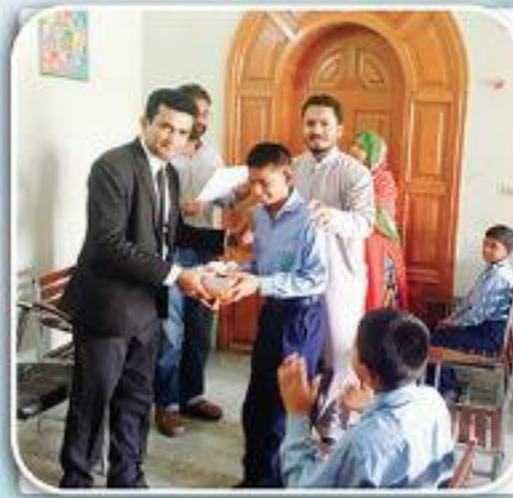
Prize Distribution Ceremony for Child Protection School Bahawalpur